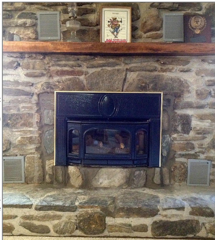
Finished product... when the mortar dries it will blend right in!

Use of the fireplace couldn't be easier. It is controlled by the thermostat for the north wall-mounted heater (the north heater is the one to your right when entering the living room, and the thermostat is on the other side of the living room against the kitchen wall). At the thermostat there is now a selector switch labeled for fireplace or heater. Put the selector switch to fireplace and it will light; after it has been on a short while you will hear an automatic fan come on that blows warm air out the front of the unit. A word of caution – the fireplace WILL get hot! Do not touch it! When you are done with the fireplace, switch back to the heater and the fireplace will go out. Note that the automatic fan may continue to blow for a short while.