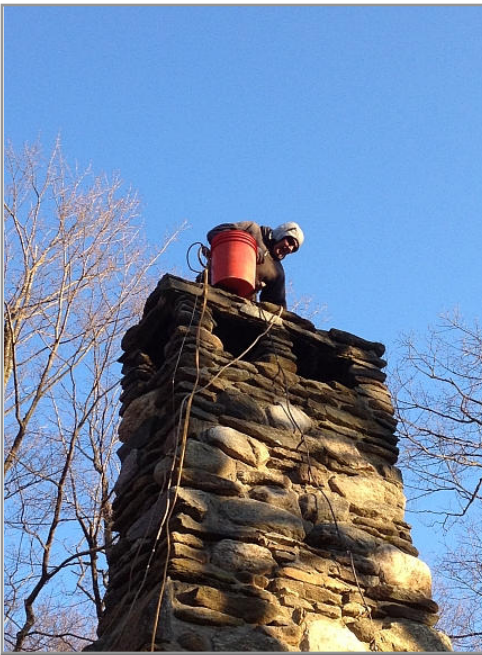
Terry McGinn wonders what he's doing up there

Many options to address this were discussed, and in the end it was decided to go with a gas fireplace insert. While certainly not as dramatic as a crackling fire, it is much safer, cleaner, and far more heat efficient. In fact, it actually produces as much heat as the existing wall-mounted propane heaters. And since it draws combustion air from beneath the lodge, the heated air inside stays there instead of going up the flue.