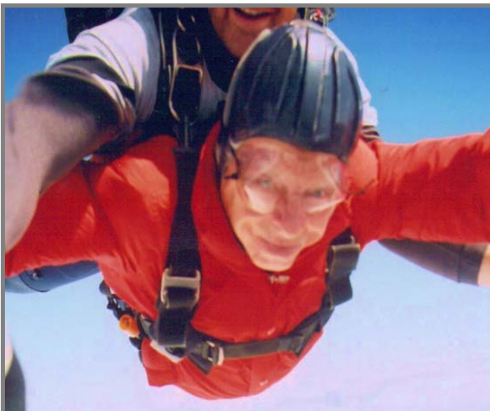
Does anybody know this man??

What's happening at the April meeting? If you think you know the mystery man to the left, be sure to come out to the April meeting to celebrate a milestone for both him and the club!