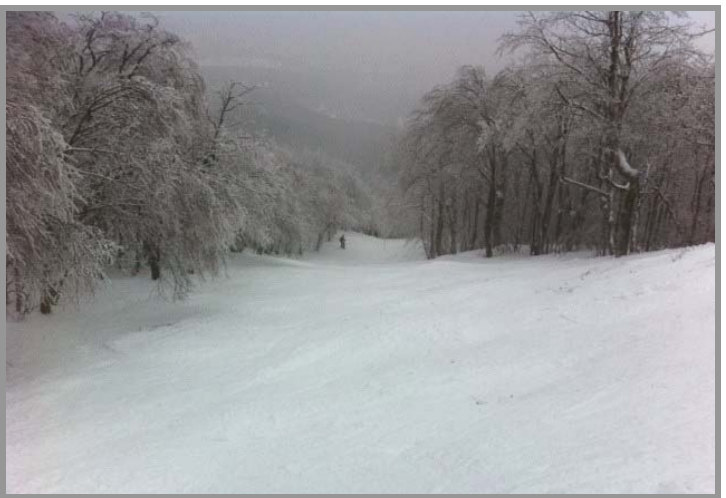
Looking down the Big Bend, first big drop from the start