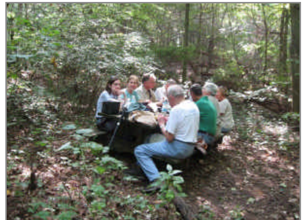
Sept 23 short hike at Myrick Preserve—Looks like more eating than hiking!!