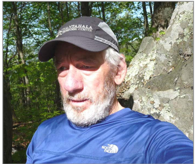
Have you seen this man?