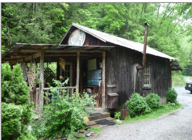
Scenes from the Trail: Above Left— Hiker Hostel along the trail