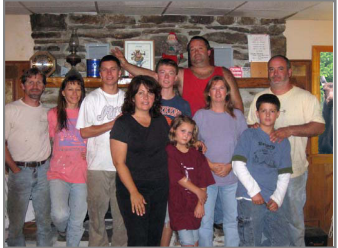
The Gang of Ten