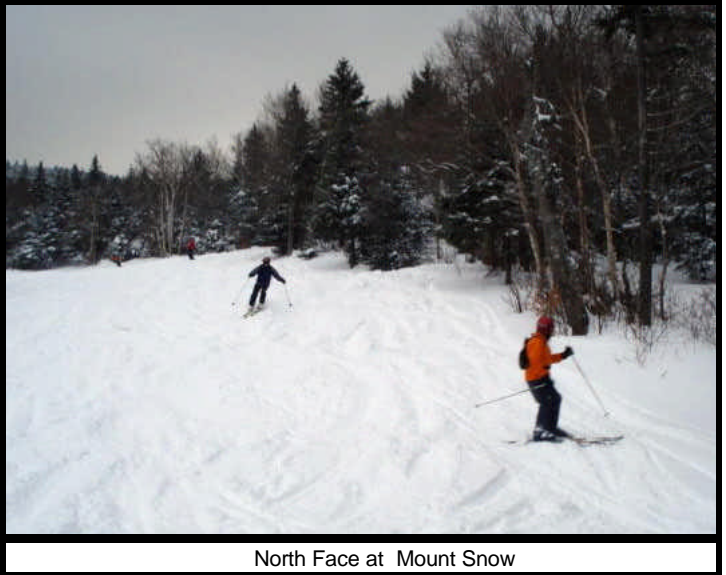
North Face at Mount Snow