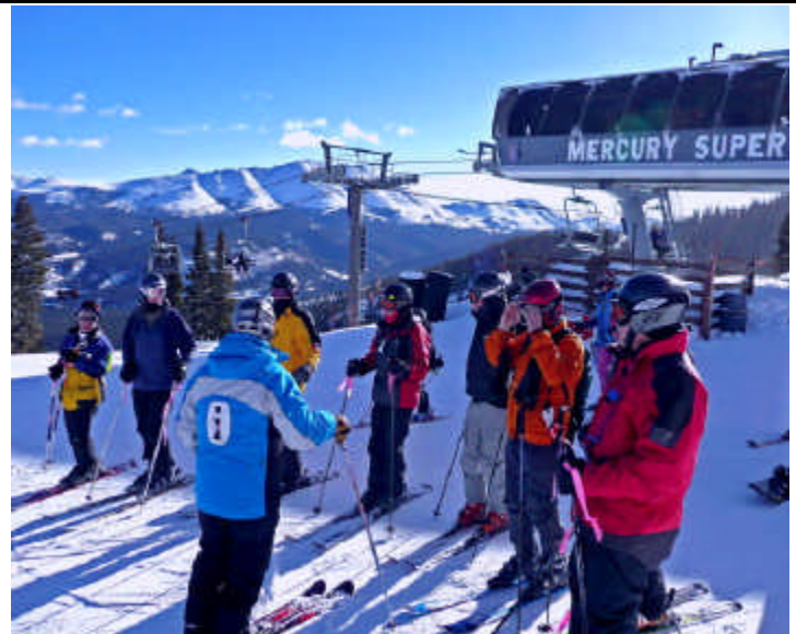
Above: First day mountain orientation tour at Breckenridge

The 2008 Directory has been mailed to all members, and should have been received by now. However, a few copies have been returned damaged in the mail. If you have not received yours, please contact Mel Stiles and a new one will be sent out.