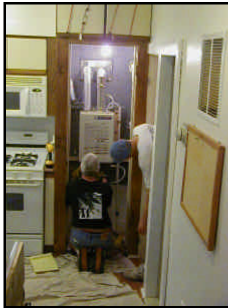
Water heater installation

Installation of the water heater took a full three