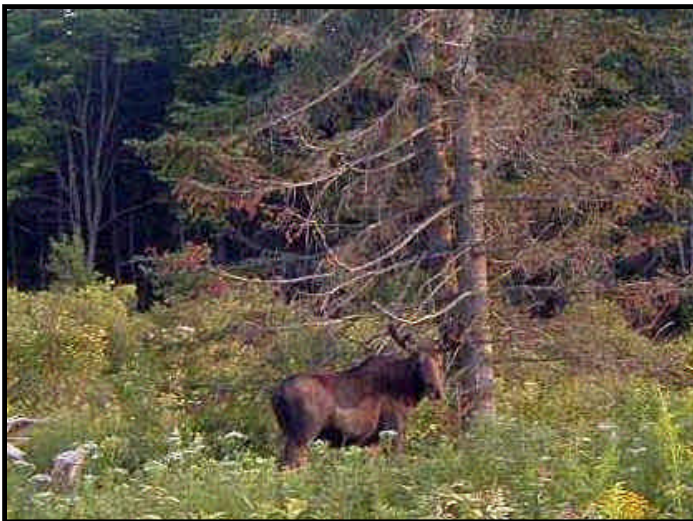
Are you looking at me?

Contact Glenn Weisel to sign up: home/office 215-822-9459 / fax 215-822-9249 / Cell 215-534-6364, or email to: glenskisail@comcast.net.