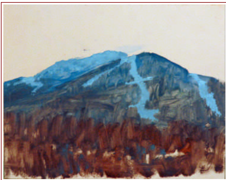
Above: Jay Peak at Sunset. Above right: Ice Goblins