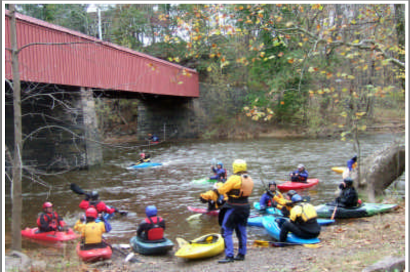
Above: gathering at the put-in Left: a line to get off the river!

The day dawned gray, damp, & windy as tropical storm Noel passed through. However, it certainly did not deter the many boaters that descend upon the Tohickon during a water release. The scene there certainly has changed over the years... there were vehicles from as far as Indiana, & there was a steady procession of boats down the creek. There were even vendors at the Point Pleasant take-out!